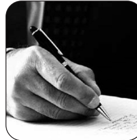
TM & Design registration services for members

10. ACID Mediation - This is a cost and time effective way to solve member-to-member disputes. All ACID members have signed the ACID Code of Conduct which requires each member not knowingly to copy the products of another company. Despite all precautions, disputes can arise between fellow members of ACID concerning origin or ownership of one or more designs or products. Where such a dispute arises and the members are unable to resolve their dispute between themselves, the Code of Conduct requires them to resolve their disputes by mediation rather than through the Courts. An ACID mediation is a means by which members can attempt to resolve disputes amicably in a non-confrontational manner and with a minimum cost to all those involved. It is designed to facilitate negotiations between parties by a neutral third party with no decision-making power (usually a barrister with experience in this type of dispute). The neutral party helps the parties to reach their own settlement voluntarily by structuring negotiation, enabling each party's needs and the issues involved to be identified clearly and discussed, and if requested, making confidential recommendations on disputed issues.