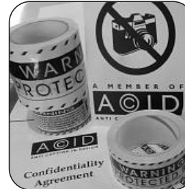
ACID Branded Merchandise including tapes and confidentiality agreements